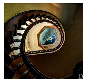
ARISTON DE LEON