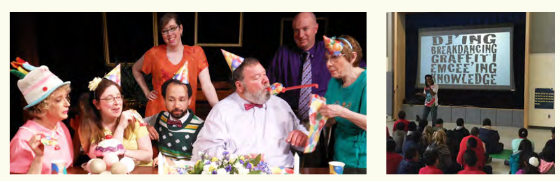
Plein Air painter in the Leonardtown A&E District. Cast of The Dining Room by the Tred Avon Players of Oxford. Felegy Elementary in Prince George's County hosts Rock the Mic with Artist-in-Residence Bomani.