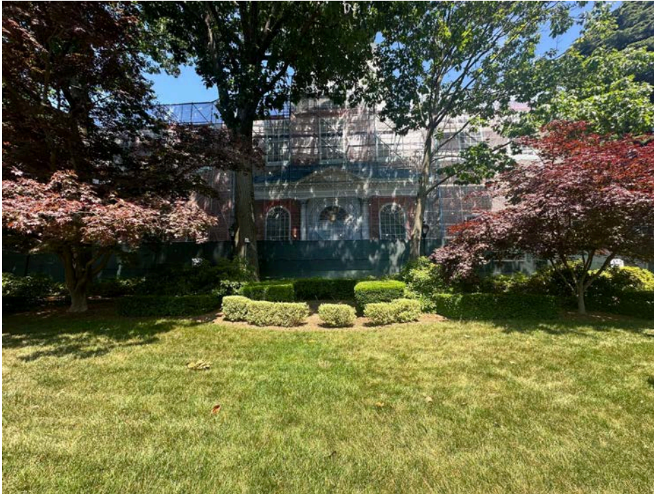
Existing site for proposed location of Monument