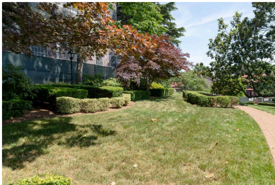
View of proposed Monument location from left (note State House is under renovation)