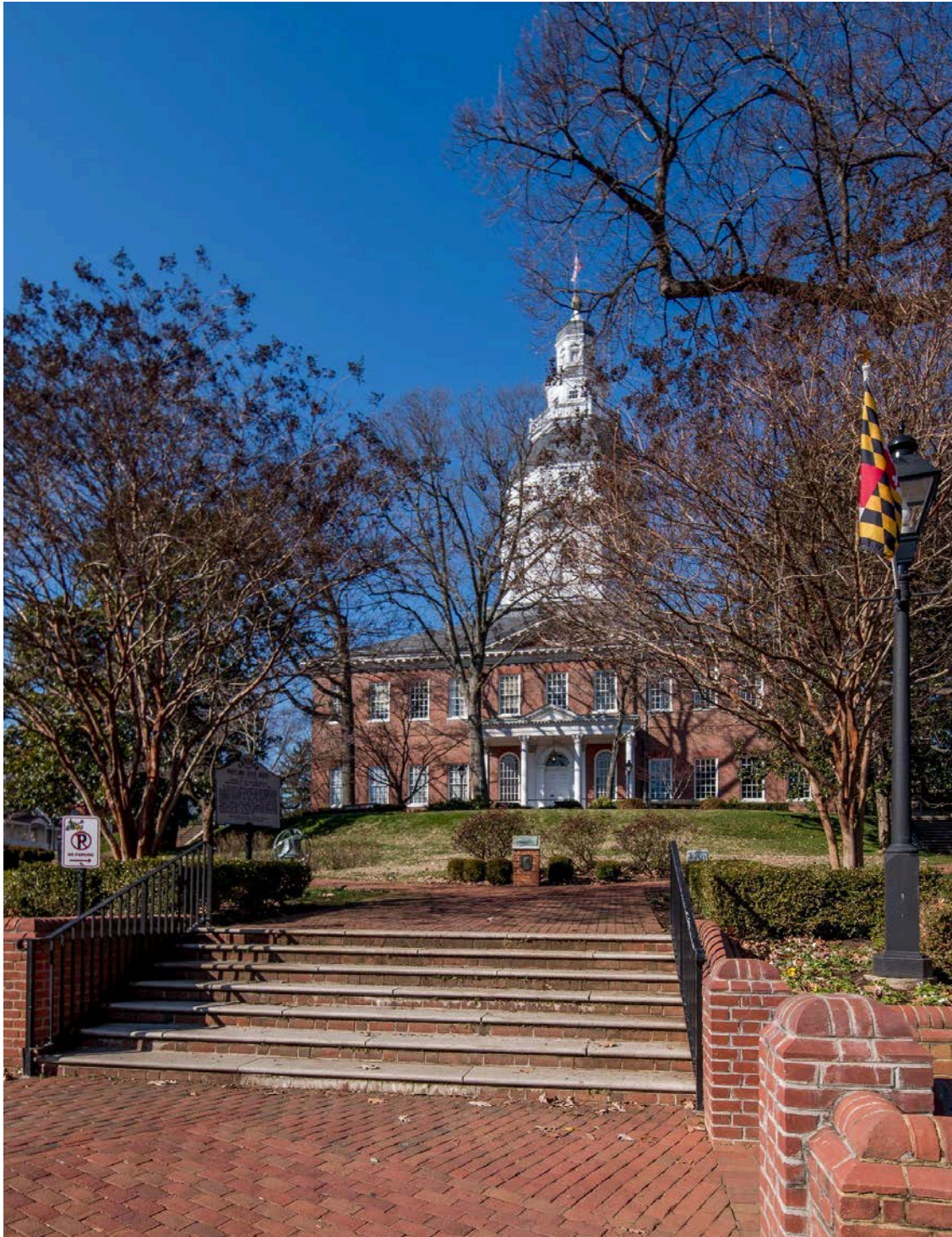
View from State House Circle at Francis Street looking up towards the State House and the proposed Monument location in front of the portico.