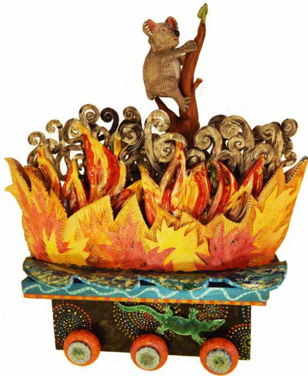
burning boat . ceramic, wood, paint and glazes . 14" x 17" . 2020