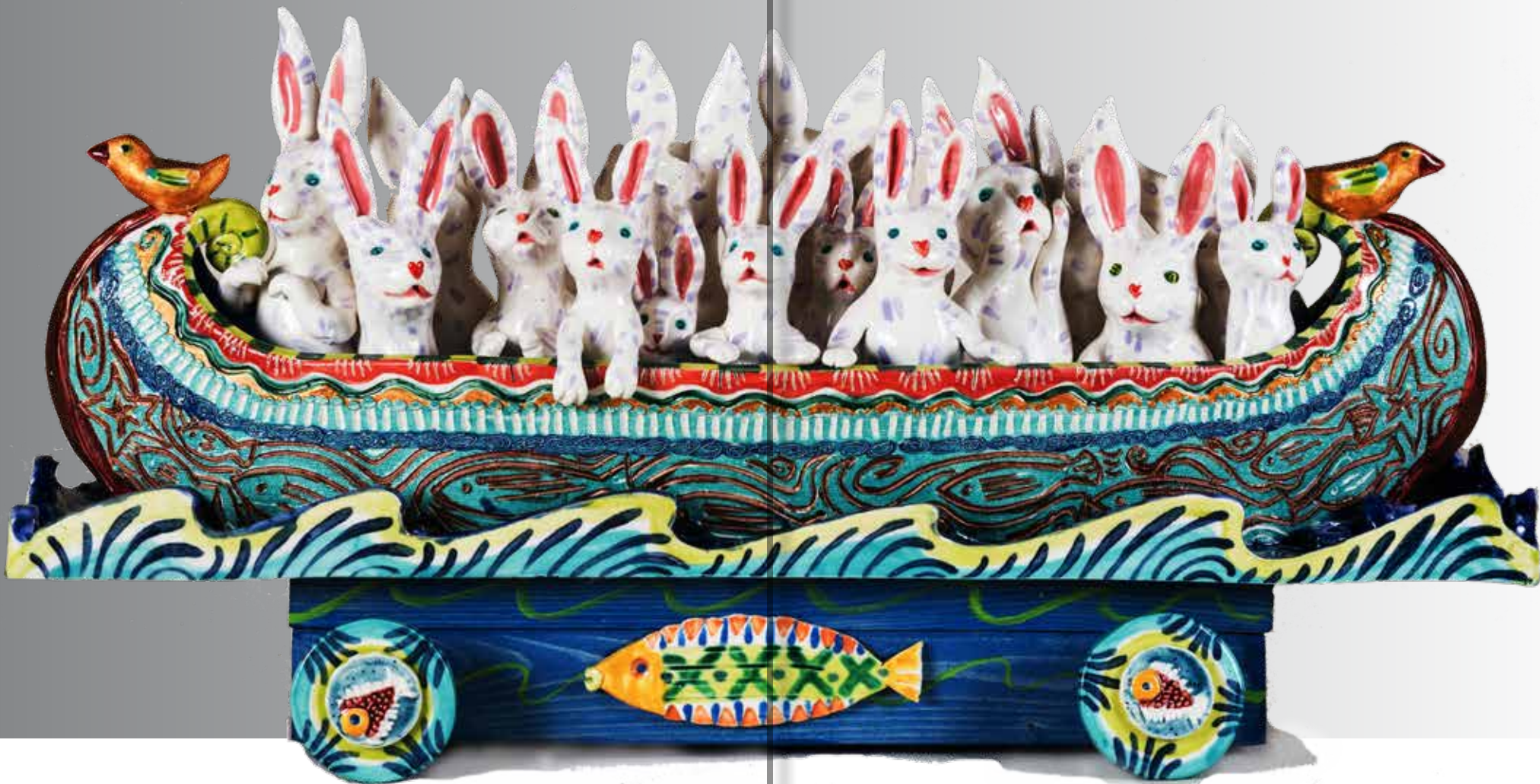
tippy canoe & migrants to. . . ceramic, glass bead eyes, wood, paint and glazes . 20" x 10" . 2019