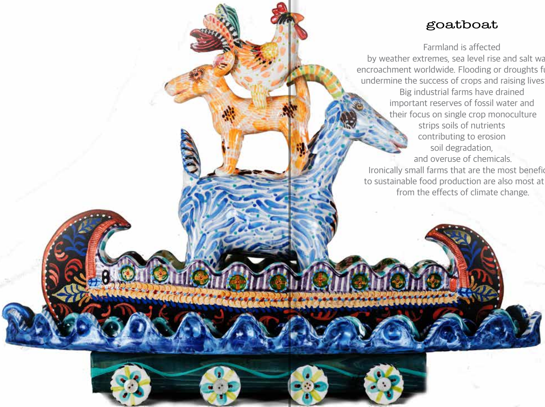
goatboat . ceramic, glass bead eyes, wood, metallic paint and glazes

Ironically small farms that are the most beneficial to sustainable food production are also most at risk from the effects of climate change.