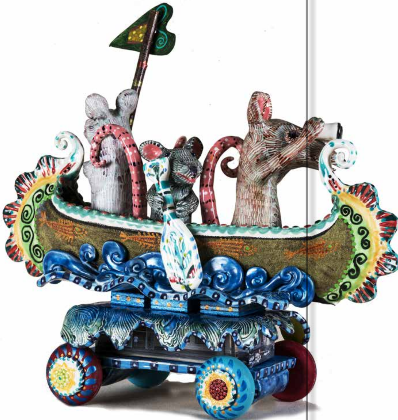
water ratz . cityscape collage, ceramic, a stick, beer bottle caps, glass bead eyes, wood, paint and glazes . 16" x 16" . 2019