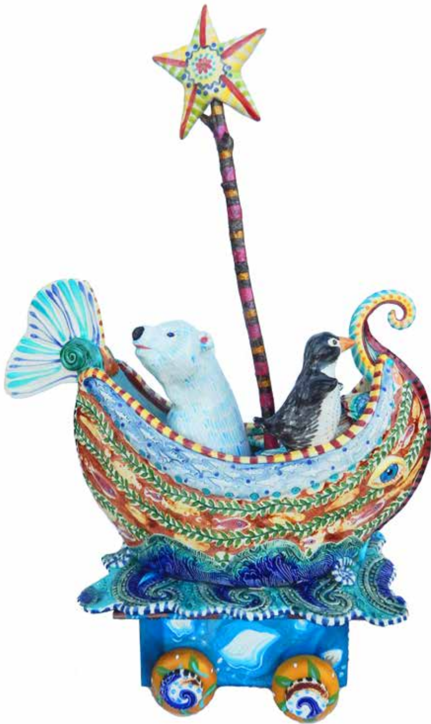
home less ice . ceramic, a stick, safety glass, glass bead eyes, wood, paint and glazes . 16" x 17" . 2019