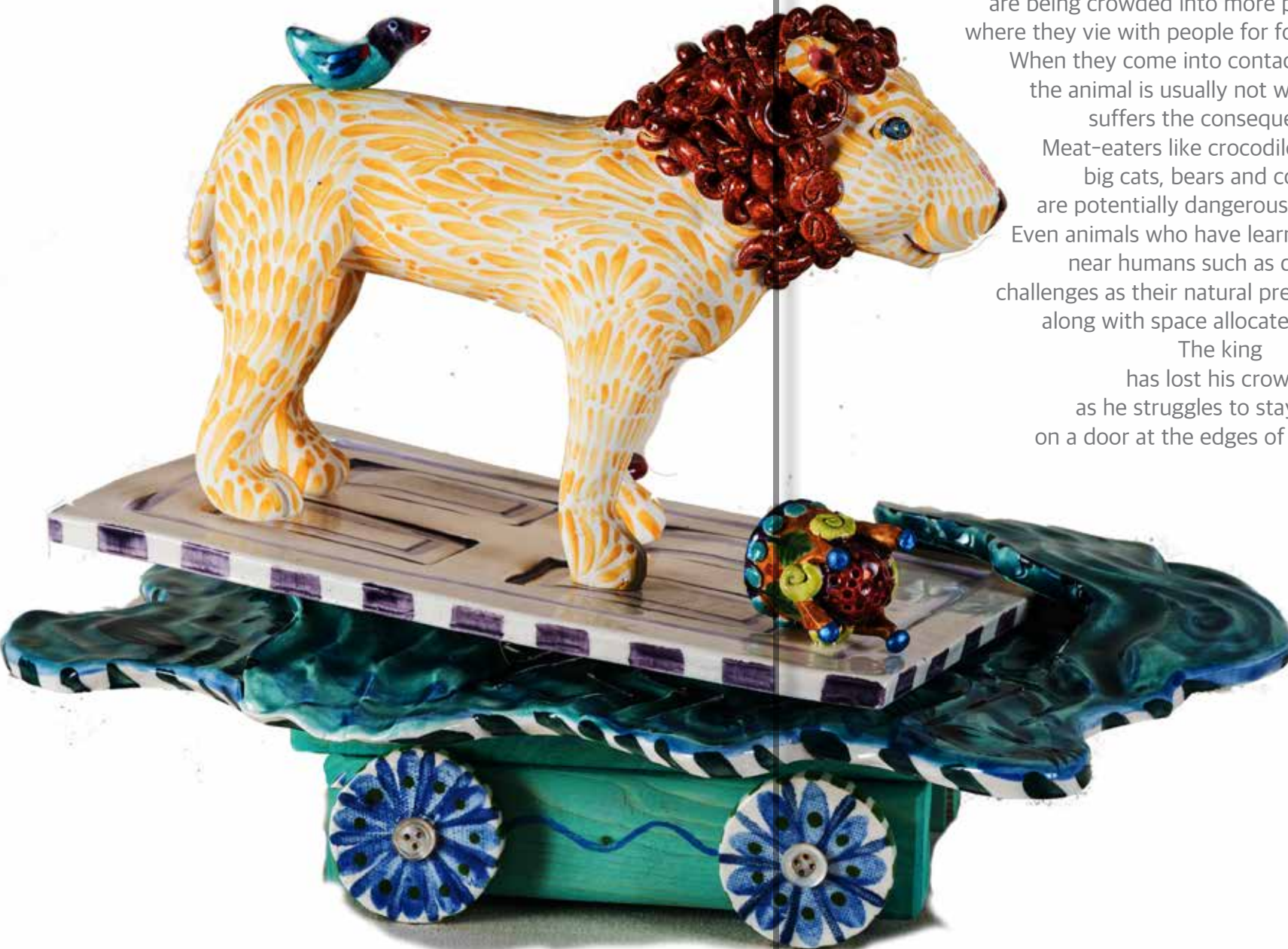
checkmate . ceramic,, glass bead eyes, wood, paint and glazes . 13" x 10" . 2019

The king has lost his crown, as he struggles to stay afloat on a door at the edges of civilization.