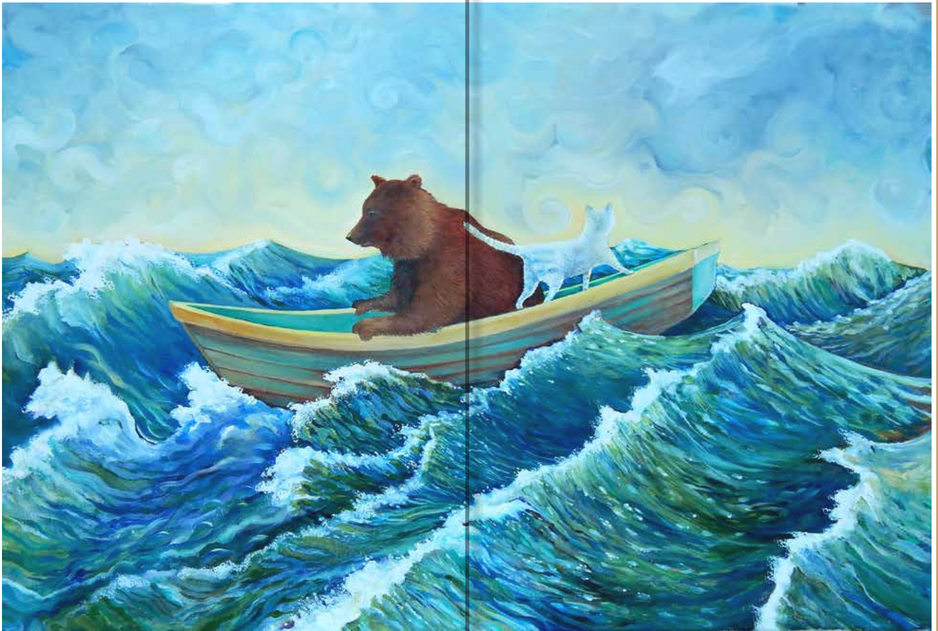
bare boat oil . 36 x 24 2019 . Dana Simson

A series of oil paintings compliment the folk art ceramic boats. For more information on "The Animals are Innocent" exhibit contact Dana hello@danasimson.com